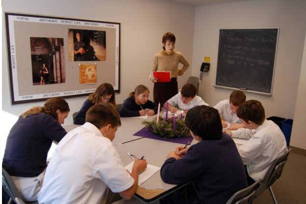
Small classroom size encourages learning

Our students prepare for a lifetime of learning by studying Catholic history and doctrine, college preparatory subjects, and the primary works of civilization's greatest thinkers, mentored by teachers who foster a deep love of Jesus Christ and His Church.