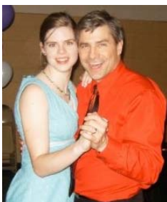
One St. Ambrose father takes his daughter around the dance floor