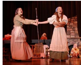
Junior High Students 2007's Fiddler on the Roof